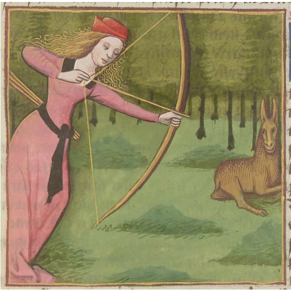
De mulieribus claris—c. 1300–1400.