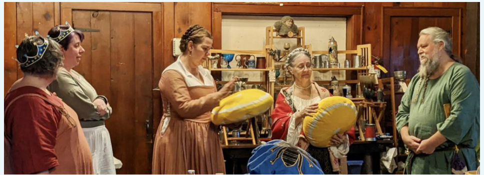
Inspection of the lemons.

— Mathghambain Ua Ruadháin Seaborse Pursuivant