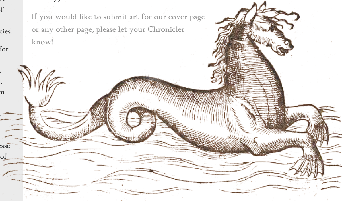
Above: detail from Historiæ animalium liber IV, p. 364 by Conrad Gesner (1516–1565).

If you would like to submit art for our cover page or any other page, please let your Chronicler know!