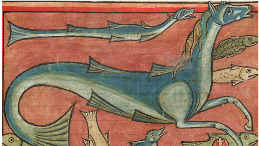
Miniature of various fish, including an eel, a sea-horse, and a creature with horns (detail). Origin: England, S. (Salisbury?)

Copyright 2019 Society for Creative Anachronism, Inc. For information on reprinting photographs, articles, or artwork from this publication, please contact the Chronicler, who will assist you in contacting the original creator of the piece. Please respect the legal rights of our contributors.