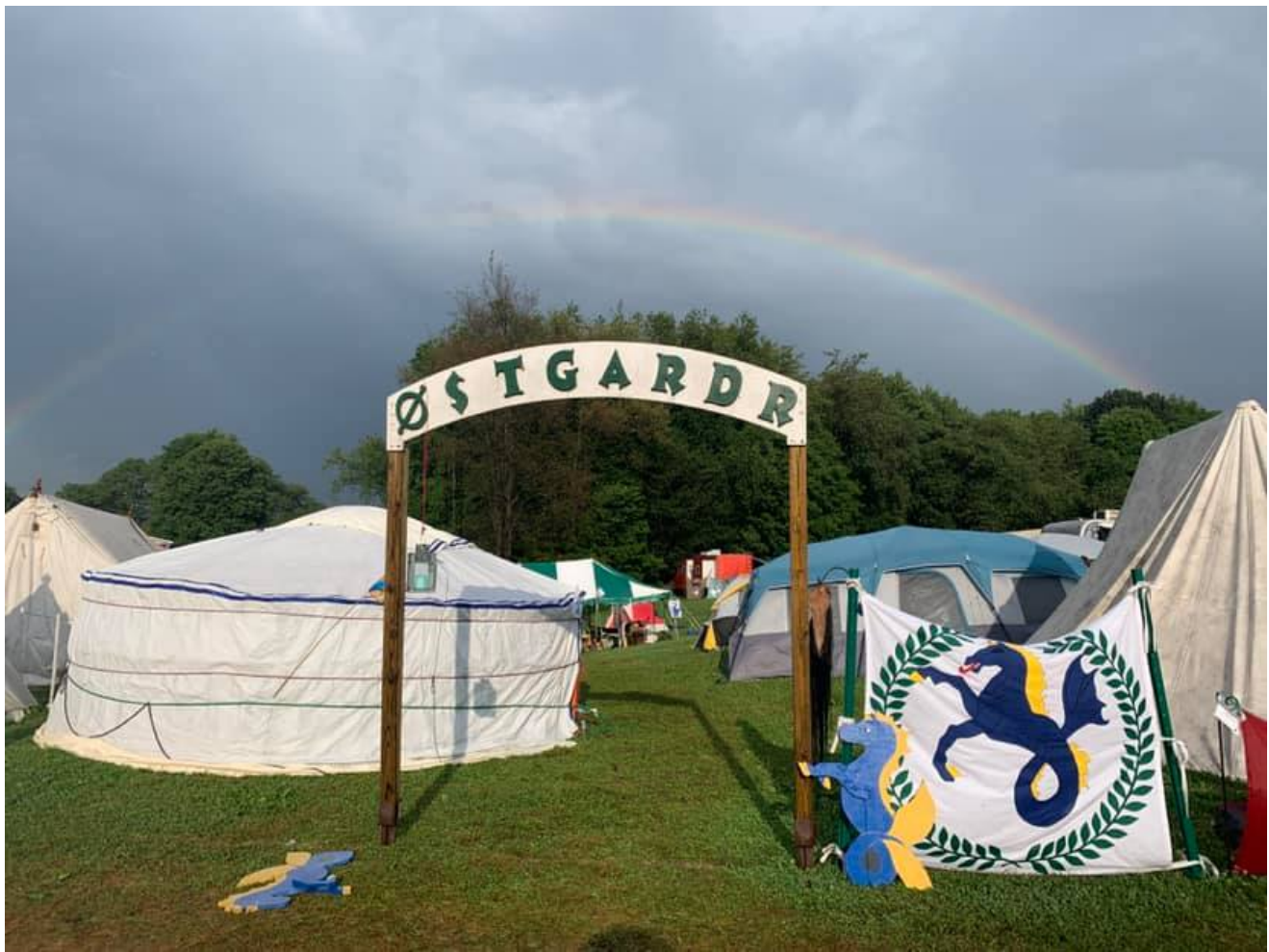
"Rainbow Over Østgarðr", 2019.